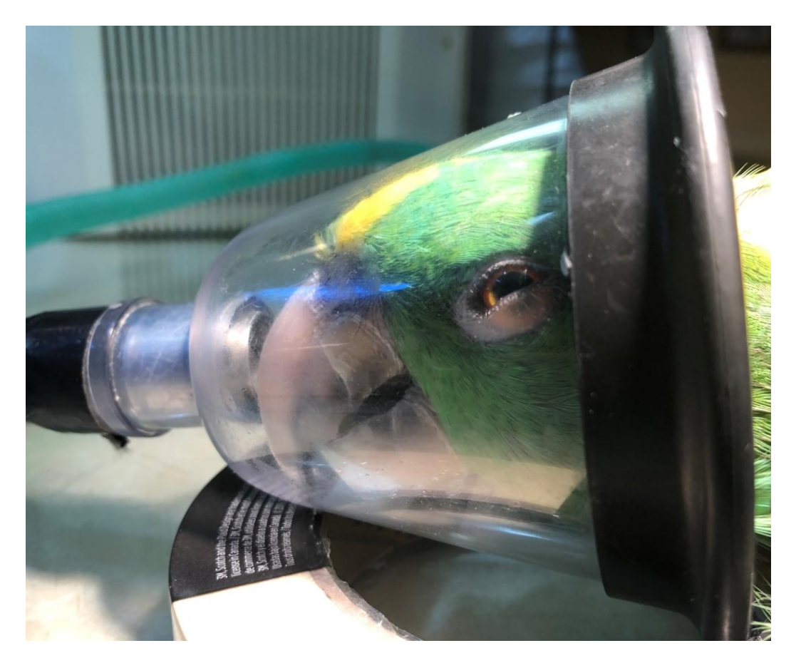
Amazon parrot being sedated with inhalation anesthesia

I use inhalation anesthesia for routine examination and grooming procedures on pet birds. This treatment technique has been developed over decades of avian practice and is time-tested, safe, cost-effective, and overwhelmingly accepted by almost all of my clients.