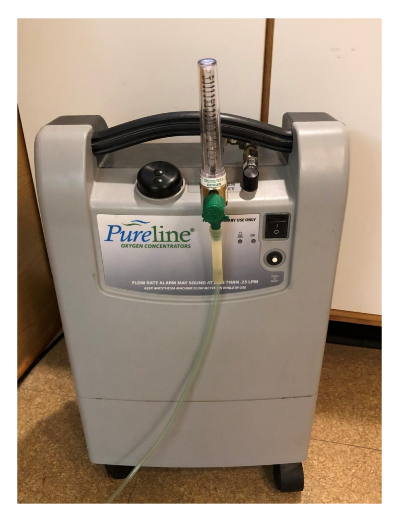
How does an oxygen concentrator work?

This portable machine weighs 32 pounds and is easily transported in my car. It has been maintenance free for over a year. I change air intake filters every 6 months. To turn it on, you just plug it in.