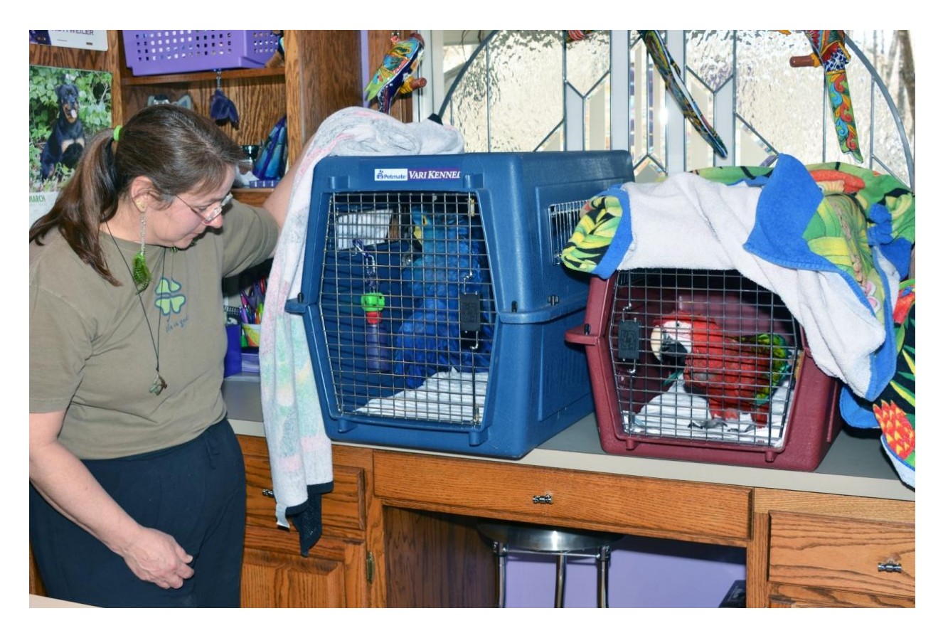
Anesthetized birds recover in their carriers for 10-15 minutes before being returned to their regular cages or allowed to leave the clinic.